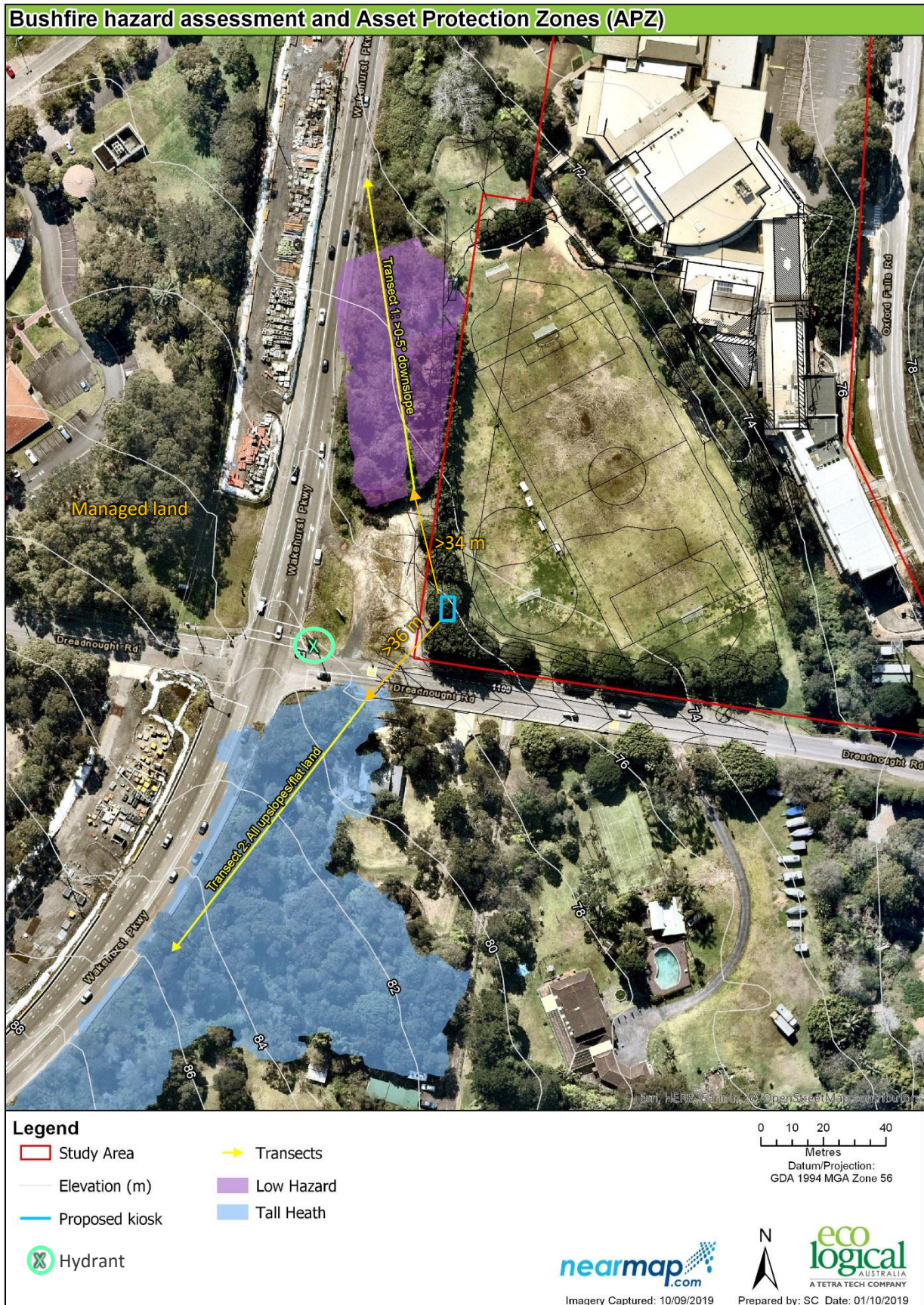
Figure 2: Bushfire hazard assessment and Asset Protection Zones (APZ)