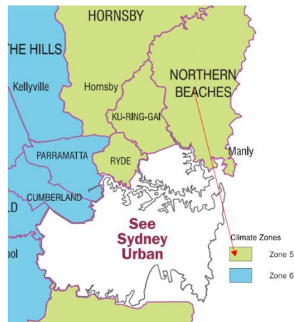
NCC Climate Zone Location